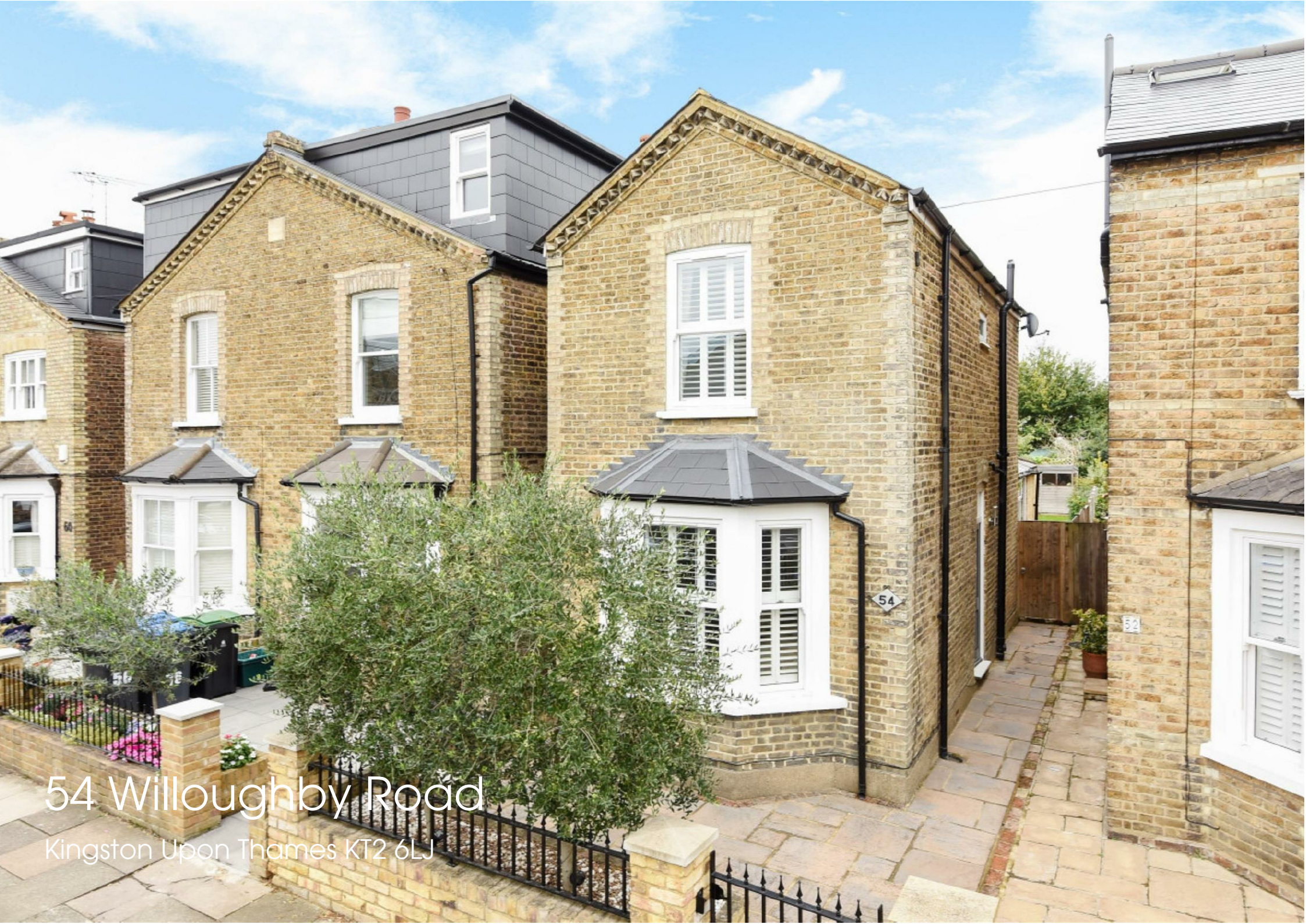
54 Willoughby Road Kingston Upon Thames KT2 6LJ

34 Richmond Road Kingston upon Thames Surrey KT2 5ED www.gibsonlane.co.uk Tel: 020 8546 5444